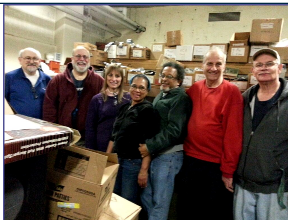
Some attendees of Westchester PC-Renew gathered to clean out the lab in preparation for the upcoming move to a new location. Club members are being asked to help find a suitable site to relocate this worthwhile workshop. Send suggestions to debmeisels@gmail.com .